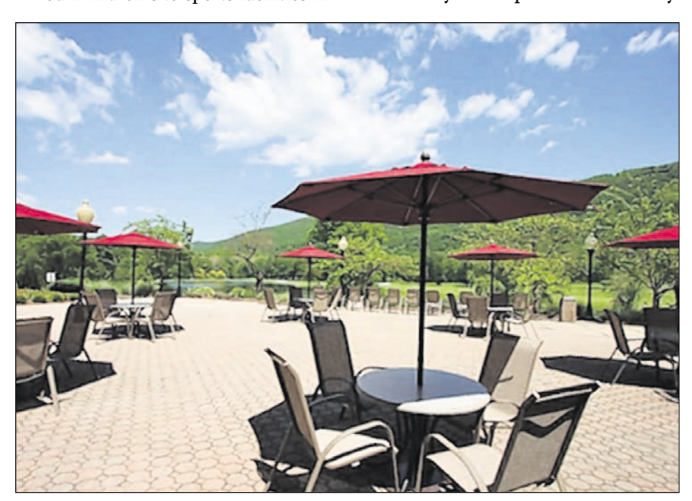
By convention weekend, winter should be a distant memory as members relax on the patio.

If you come to convention, you will be able to enjoy the workshops and inspiring speakers, network with other AAUW members, and make new AAUW friends. We hope you will join us at the convention April 25-27.