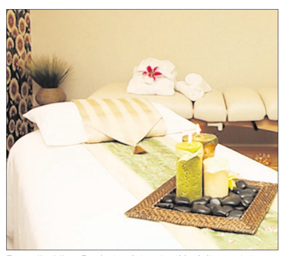
The spa at Honor's Haven offers relaxation and rejuvenation with breathtaking mountain views.

As our three eager branch members continue to walk through the convention, they'll find a variety of opportuni-